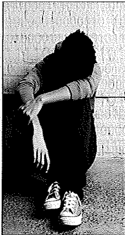
Characteristics of a Runaway and Homeless Youth