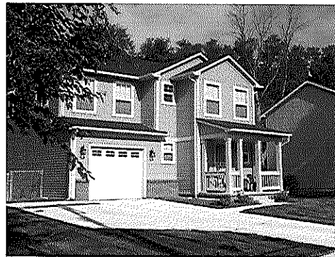
NORTHWEST DETROIT NEIGHBORHOOD DEVELOPMENT CORP. BENTLER II ON PLANVIEW

The Clinic operates as an informal advocate in a variety of settings and offers community organizations and small businesses a range of legal resources including: drafting and analyzing contracts and leases; advising and assisting in the formation of subsidiaries; assisting with government regulation such as zoning and licensing; drafting Articles of Incorporation and Bylaws; requesting tax exempt status, including income and real estate; assisting in the formation of joint ventures; providing legal support necessary for the purchase, sale and renovation of buildings and land; and policy analysis and development.