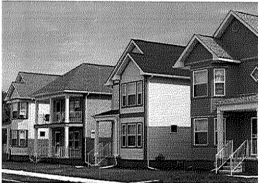
GRATIOT WOODS HOMES—HOUSING PROJECT FOR DETROIT CATHOLIC PASTORAL ALLIANCE

The Urban Communities Clinic was founded in 1991 to give community-based organizations the legal resources necessary to help improve their neighborhoods. The Clinic provides transactional legal services for groups engaged in neighborhood-based community development and to small businesses. Law students work in the Clinic under the supervision of supervising attorneys and professors. The Clinic seeks to create social change by helping organizations translate their vision into reality and contribute to the economic vitality of the region.